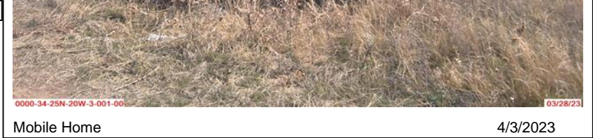
Mobile Home 4/3/2023