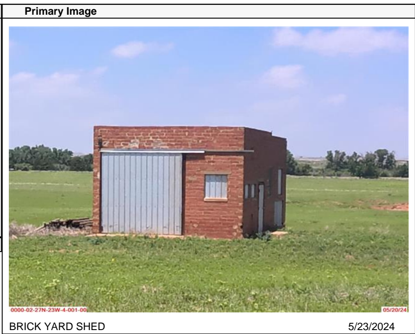
BRICK YARD SHED 5/23/2024