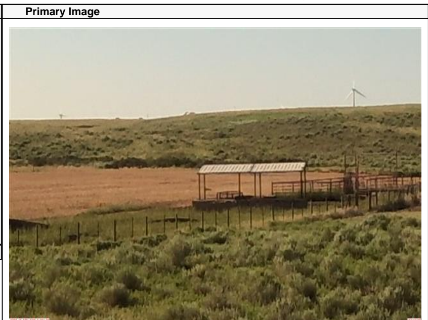
AWNING / SHELTER 7/15/2025