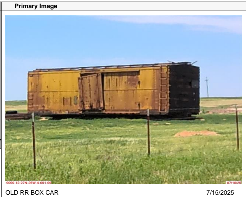
0000-12-27N-26W-4-001-00 07/10/25 OLD RR BOX CAR 7/15/2025