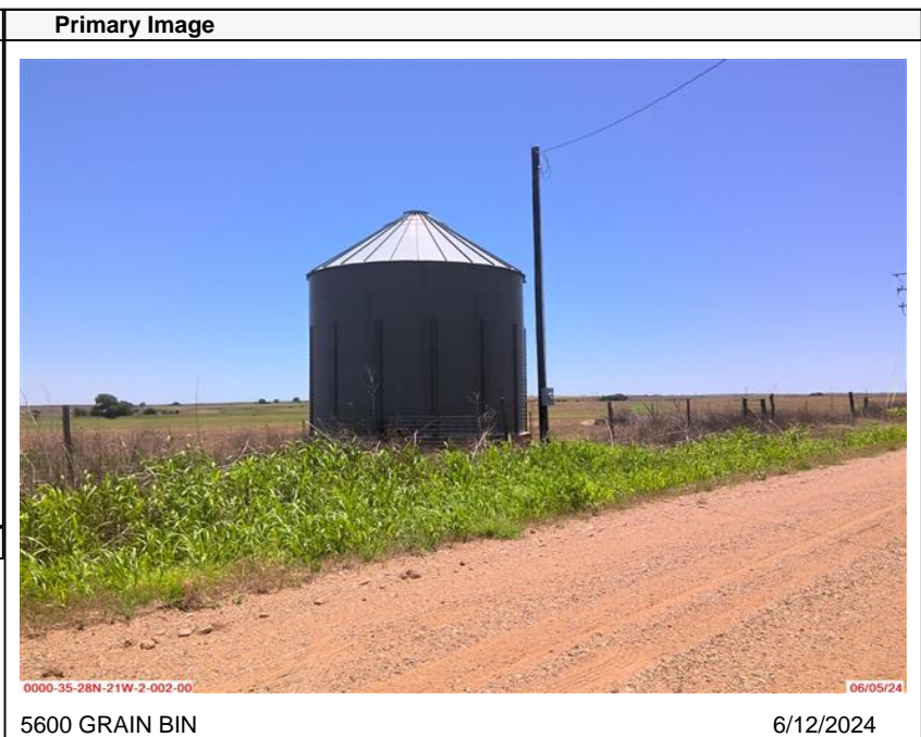
5600 GRAIN BIN 6/12/2024