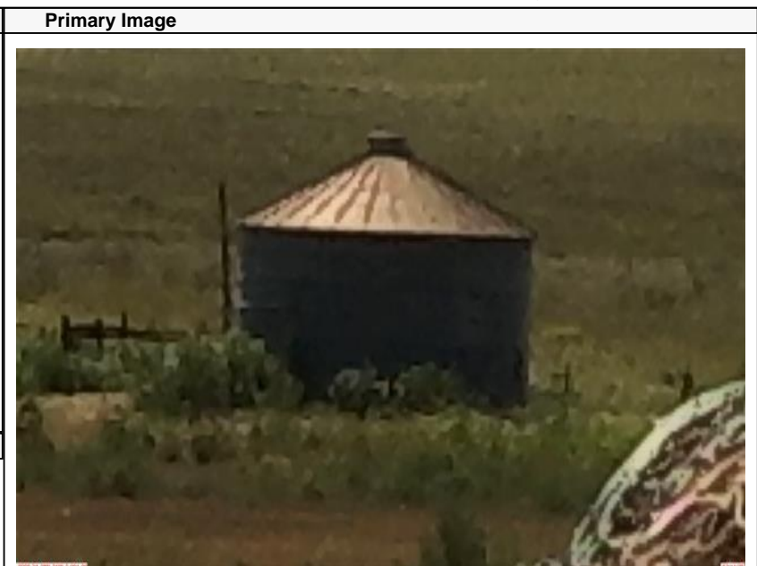
2000 BU GRAIN BIN