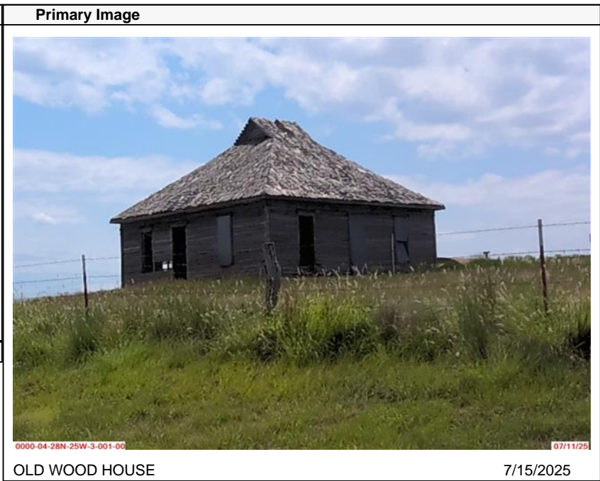
0000-04-28N-25W-3-001-00 07/11/25 OLD WOOD HOUSE 7/15/2025