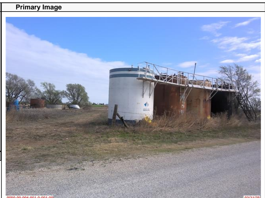
OILFIELD STORAGE TANKS (EMPTY) 3/31/2025