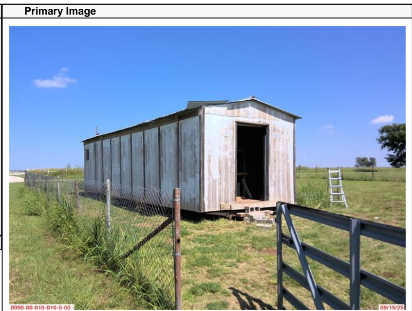
0050-00-010-010-0-00 CHICKEN COOP (NEW 2025) 9/15/2025