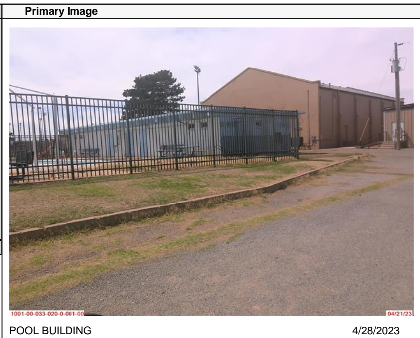
1001-00-033-020-0-001-00 04/21/23 POOL BUILDING 4/28/2023