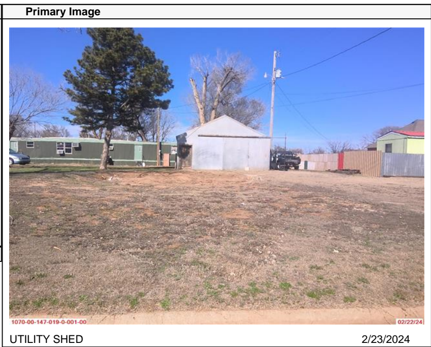
UTILITY SHED 2/23/2024