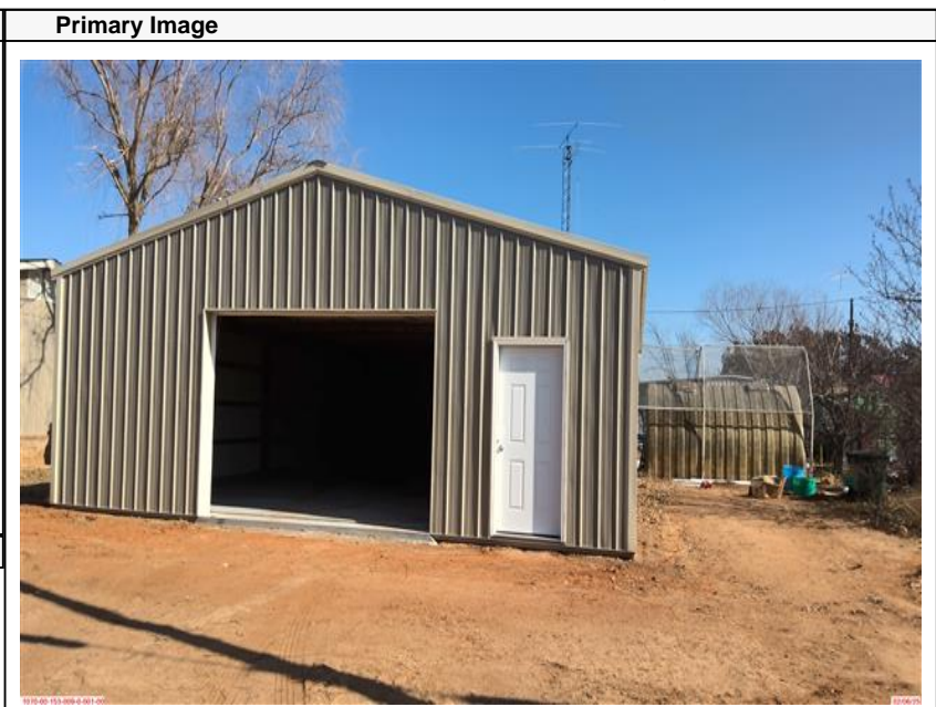
NEW SHED 2025