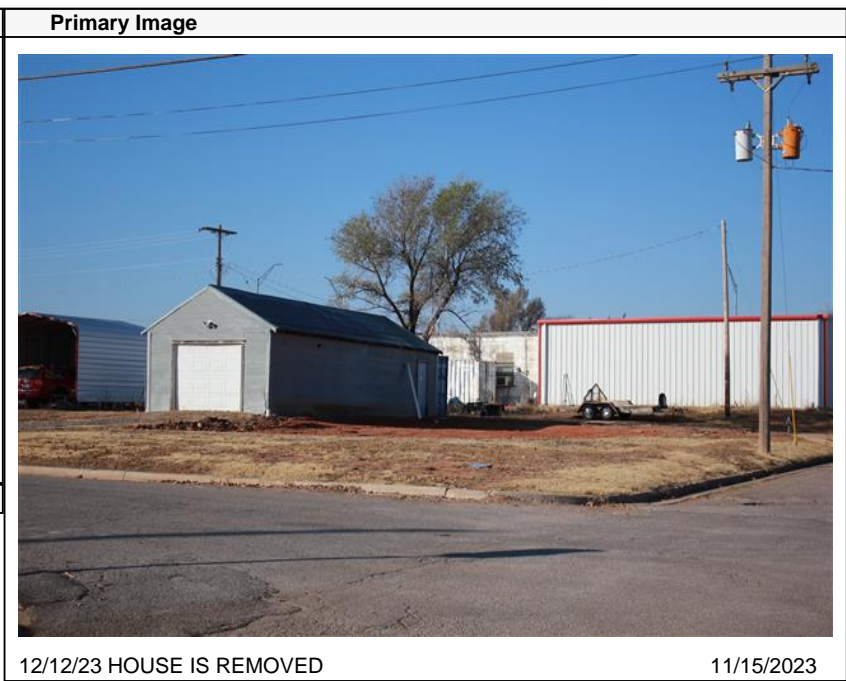
12/12/23 HOUSE IS REMOVED