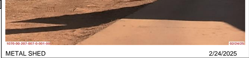
METAL SHED 2/24/2025