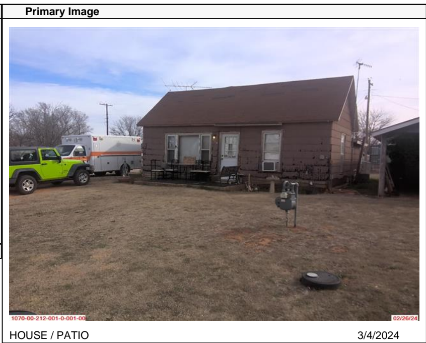
HOUSE / PATIO 3/4/2024