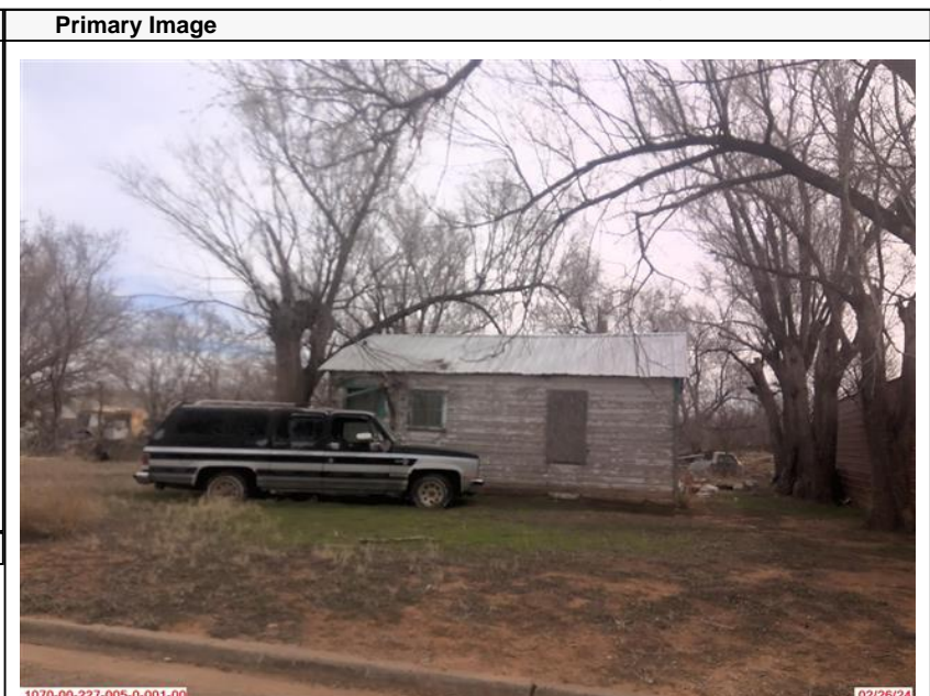
1070-00-227-005-0-001-00 OLD HOUSE 3/4/2024