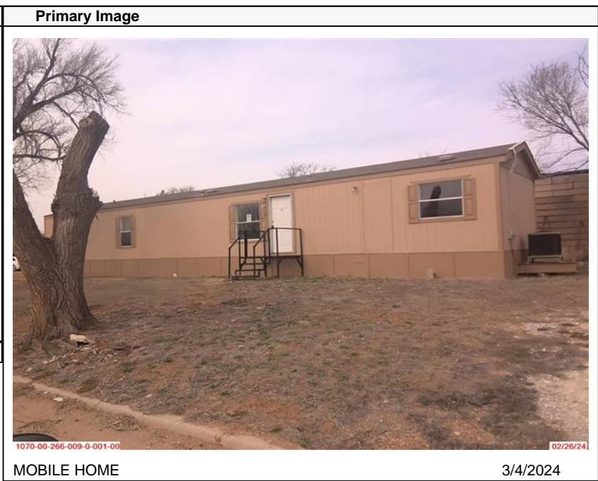
MOBILE HOME 3/4/2024