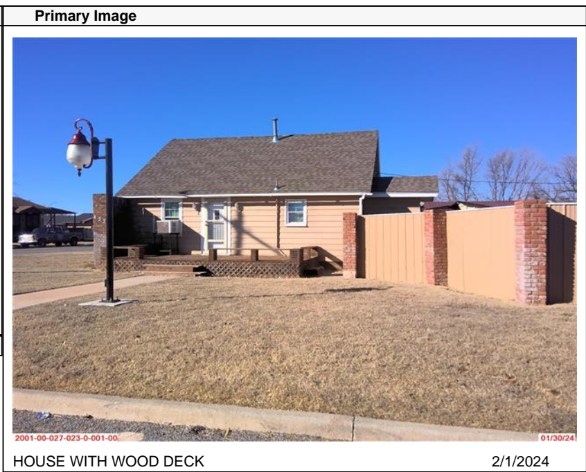
HOUSE WITH WOOD DECK 2/1/2024