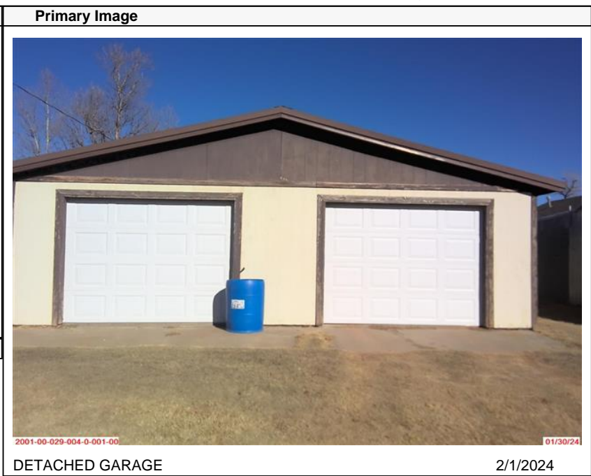
DETACHED GARAGE 2/1/2024