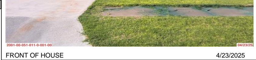
FRONT OF HOUSE 4/23/2025