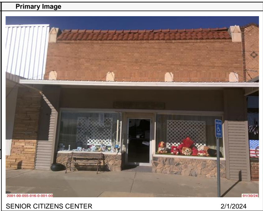
SENIOR CITIZENS CENTER 2/1/2024