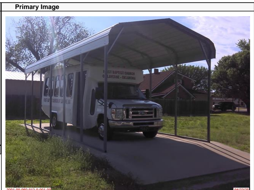
2001-00-060-013-0-001-00 04/23/25 CARPORT W/ CONCRETE BASE 4/23/2025