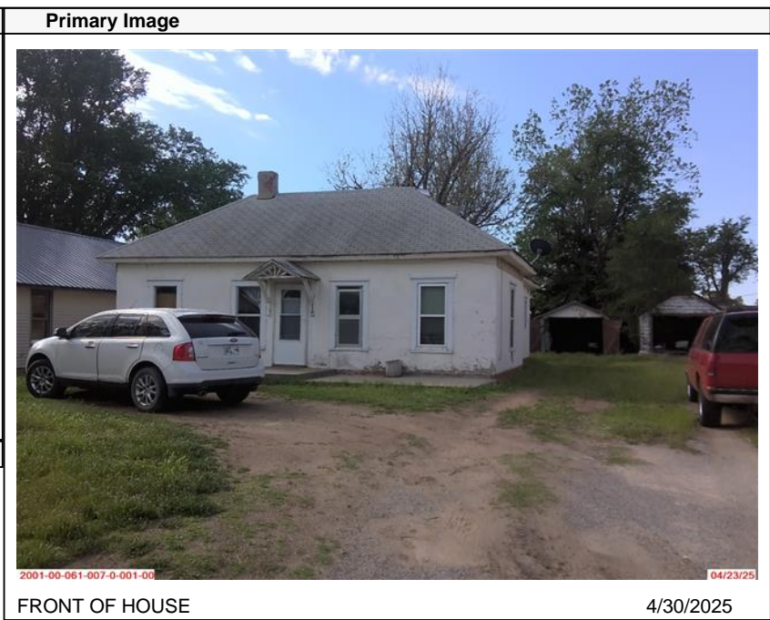
FRONT OF HOUSE 4/30/2025