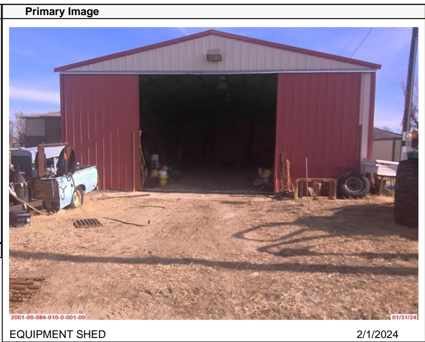
EQUIPMENT SHED 2/1/2024