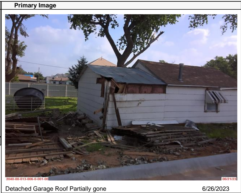
Detached Garage Roof Partially gone 6/26/2023