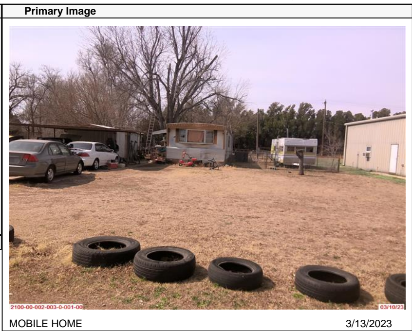
MOBILE HOME 3/13/2023