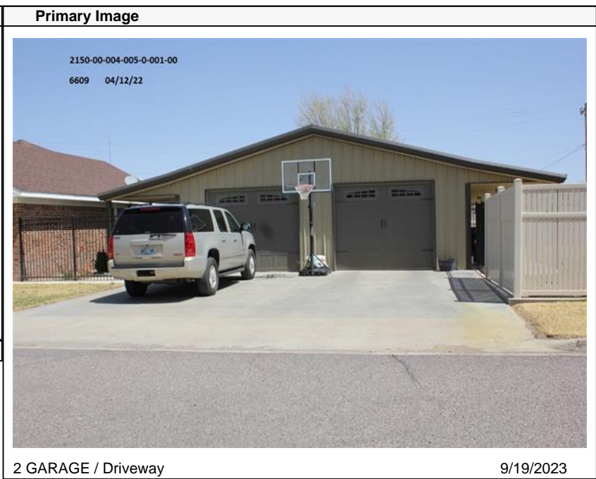
2 GARAGE / Driveway 9/19/2023