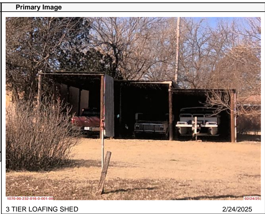
1070-00-232-016-0-001-00 02/24/25 3 TIER LOAFING SHED 2/24/2025