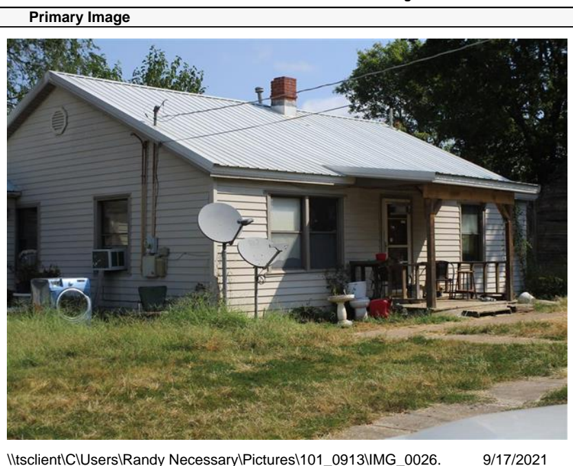
\\tsclient\C\Users\Randy Necessary\Pictures\101_0913\IMG_0026. 9/17/2021