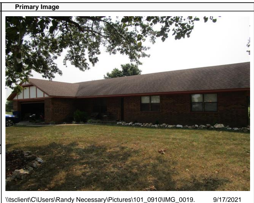
\\tsclient\C\Users\Randy Necessary\Pictures\101_0910\IMG_0019. 9/17/2021