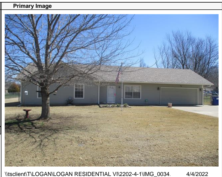
\\tsclient\T\LOGAN\LOGAN RESIDENTIAL VI\2202-4-1\IMG_0034. 4/4/2022