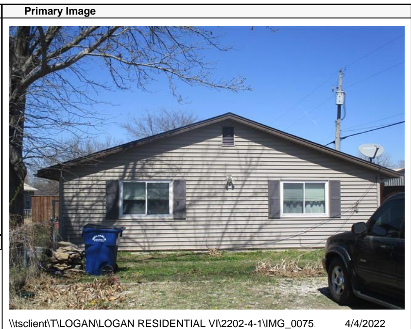
\\tsclient\T\LOGAN\LOGAN RESIDENTIAL VI\2202-4-1\IMG_0075. 4/4/2022