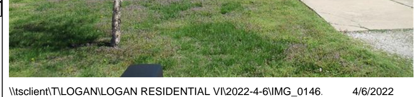
\\tsclient\T\LOGAN\LOGAN RESIDENTIAL VI\2022-4-6\IMG_0146. 4/6/2022