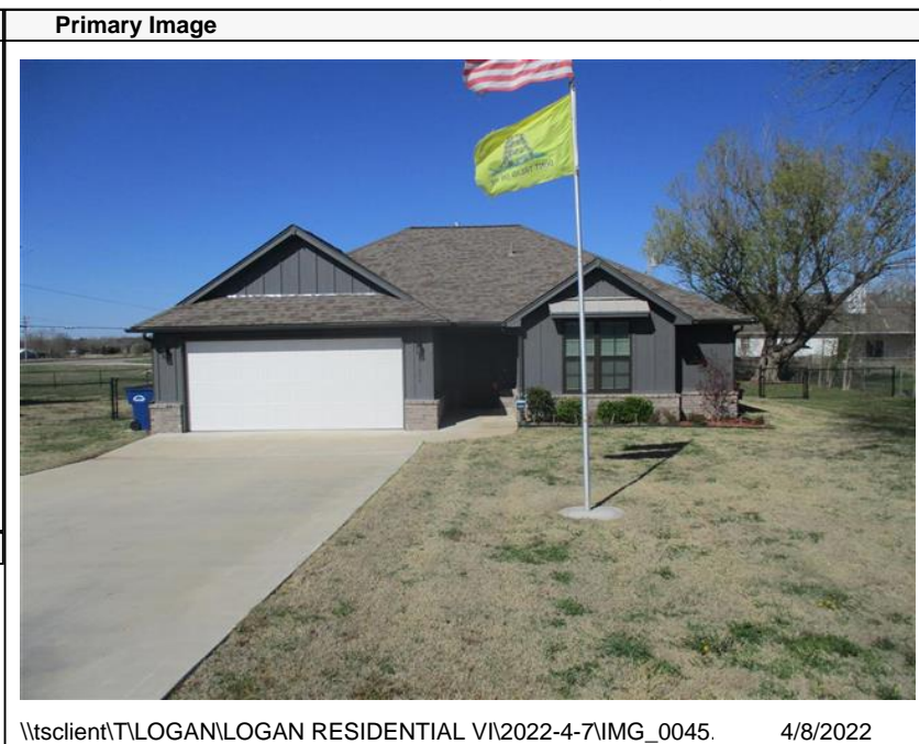
\\tsclient\T\LOGAN\LOGAN RESIDENTIAL VI\2022-4-7\IMG_0045. 4/8/2022