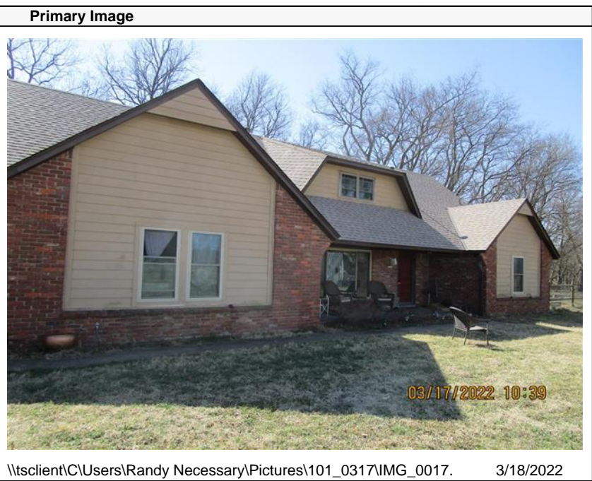
\\tsclient\C\Users\Randy Necessary\Pictures\101_0317\IMG_0017. 3/18/2022