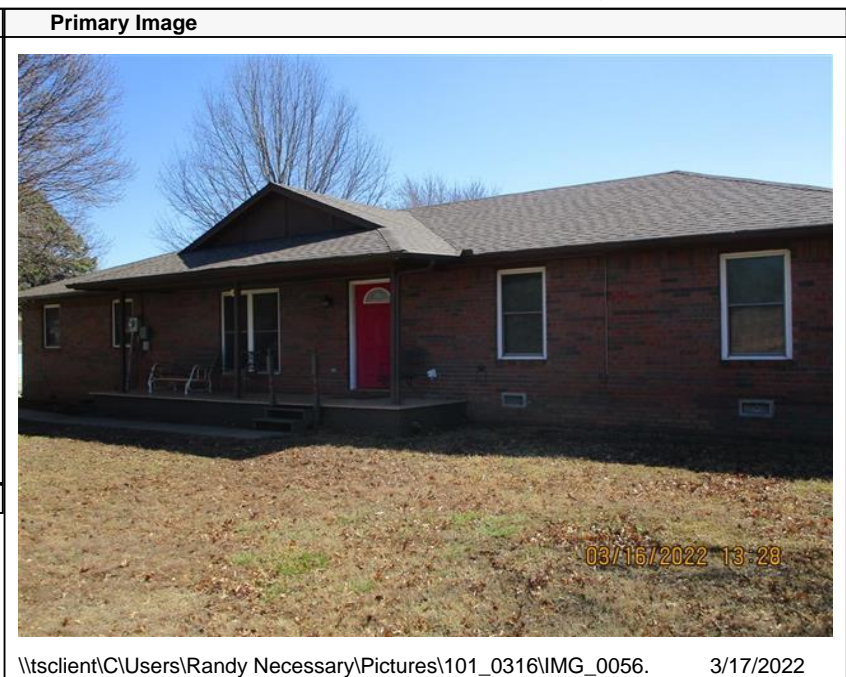
\\tsclient\C\Users\Randy Necessary\Pictures\101_0316\IMG_0056. 3/17/2022