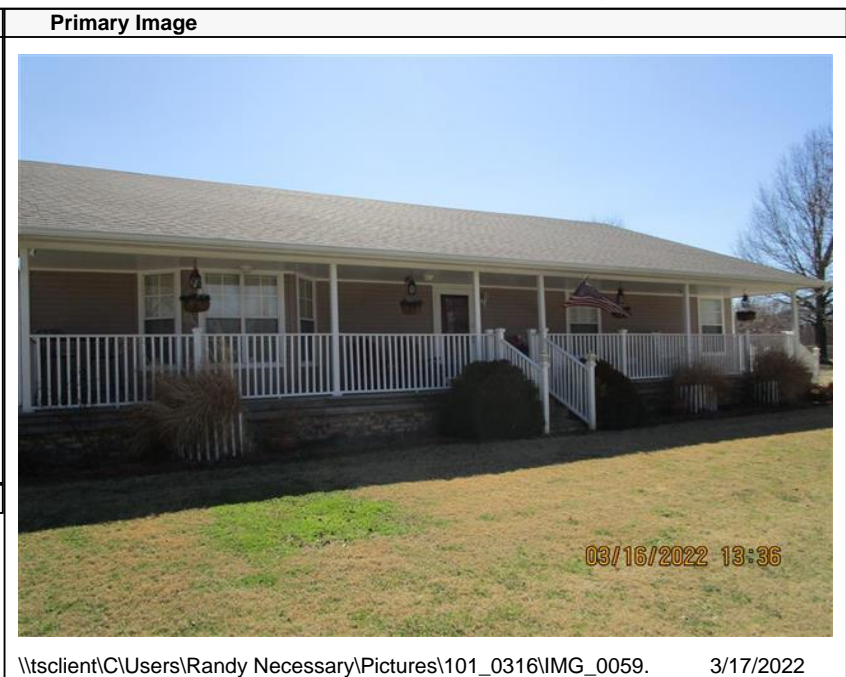
\\tsclient\C\Users\Randy Necessary\Pictures\101_0316\IMG_0059. 3/17/2022