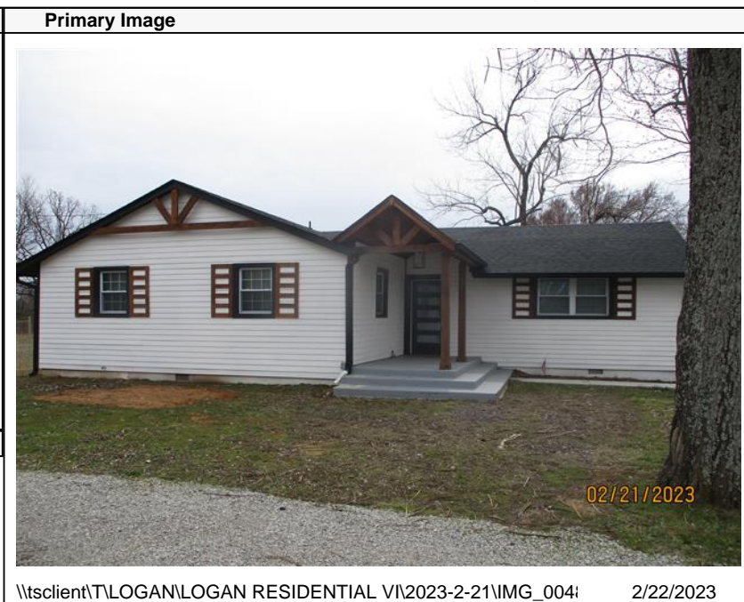
\\tsclient\T\LOGAN\LOGAN RESIDENTIAL VI\2023-2-21\IMG_004 2/22/2023