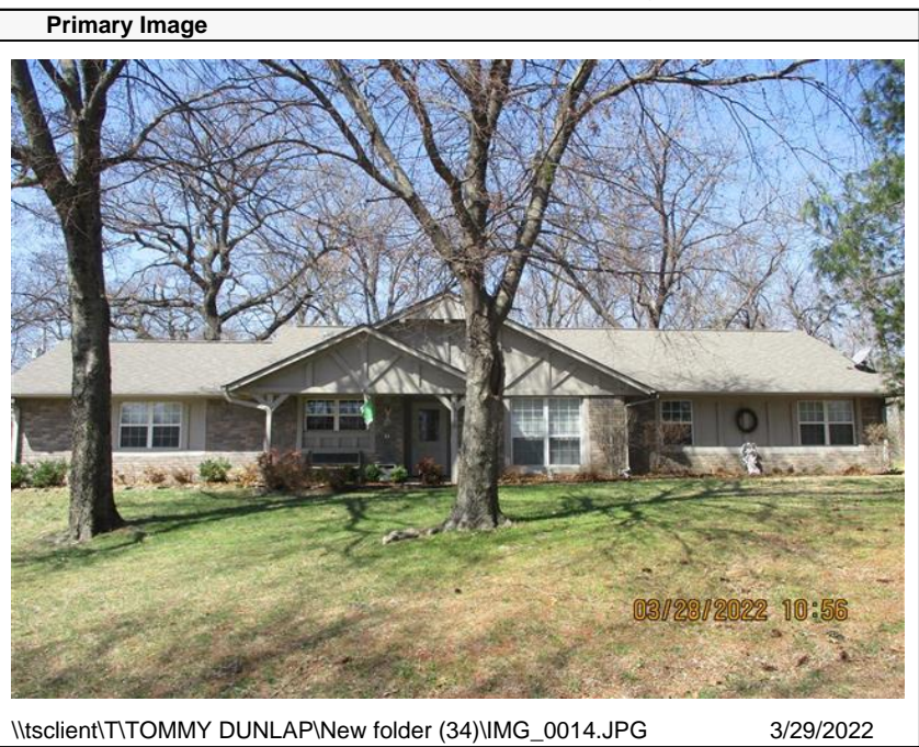
\\tsclient\T\TOMMY DUNLAP\New folder (34)\IMG_0014.JPG 3/29/2022