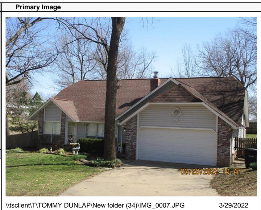
\\tsclient\T\TOMMY DUNLAP\New folder (34)\IMG_0007.JPG 3/29/2022