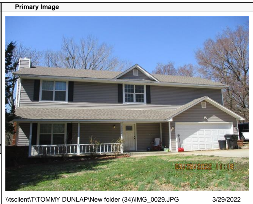
\\tsclient\T\TOMMY DUNLAP\New folder (34)\IMG_0029.JPG 3/29/2022