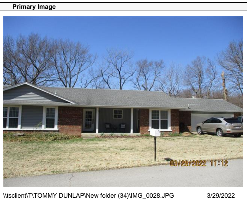
\\tsclient\T\TOMMY DUNLAP\New folder (34)\IMG_0028.JPG 3/29/2022