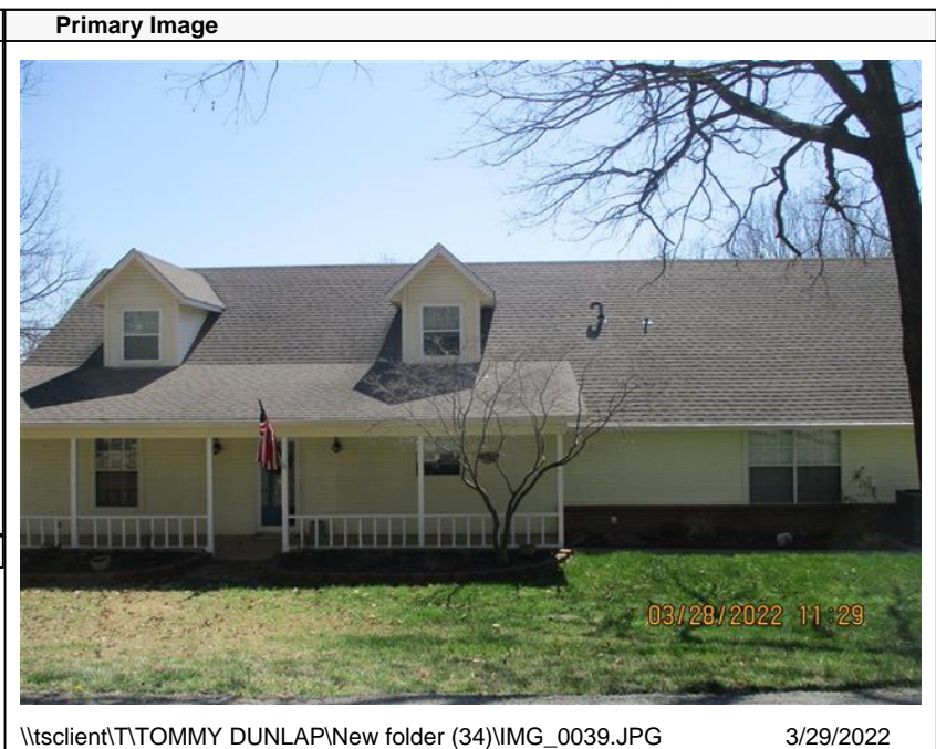
\\tsclient\T\TOMMY DUNLAP\New folder (34)\IMG_0039.JPG 3/29/2022