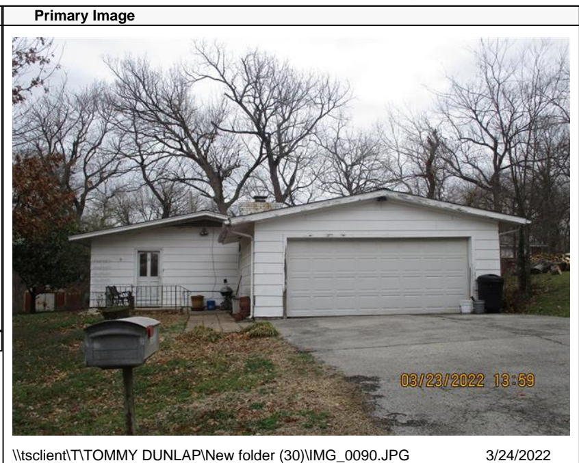
\\tsclient\T\TOMMY DUNLAP\New folder (30)\IMG_0090.JPG 3/24/2022