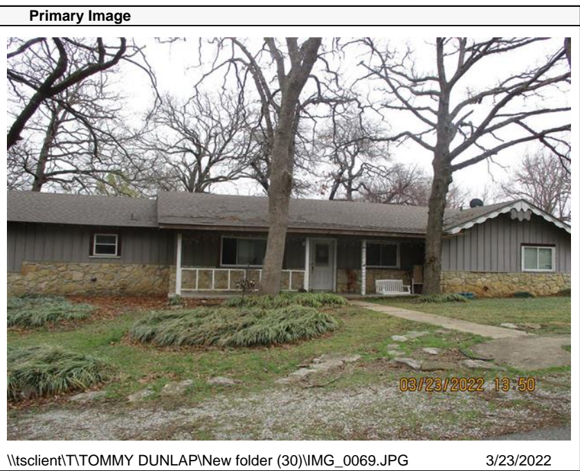
\\tsclient\T\TOMMY DUNLAP\New folder (30)\IMG_0069.JPG 3/23/2022