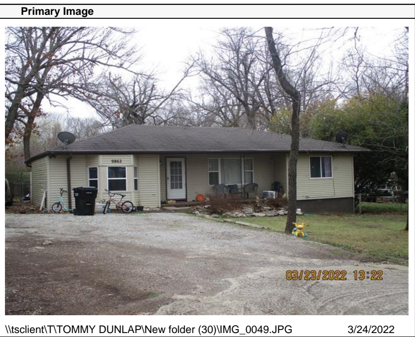
\\tsclient\T\TOMMY DUNLAP\New folder (30)\IMG_0049.JPG 3/24/2022