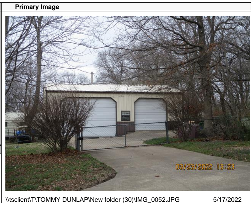
\\tsclient\T\TOMMY DUNLAP\New folder (30)\IMG_0052.JPG 5/17/2022