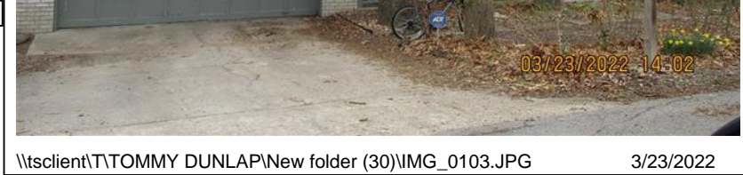
\\tsclient\T\TOMMY DUNLAP\New folder (30)\IMG_0103.JPG 3/23/2022