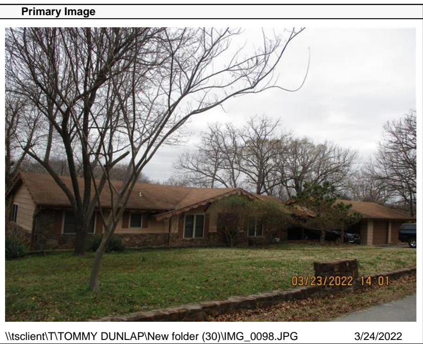
\\tsclient\T\TOMMY DUNLAP\New folder (30)\IMG_0098.JPG 3/24/2022