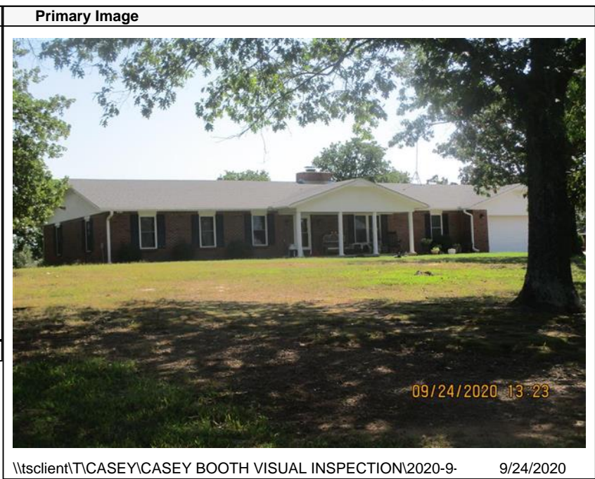
\\tsclient\TCASEY\CASEY BOOTH VISUAL INSPECTION\2020-9- 9/24/2020